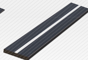
Fire Rated Packer 3mm x 15mm x 100mm White